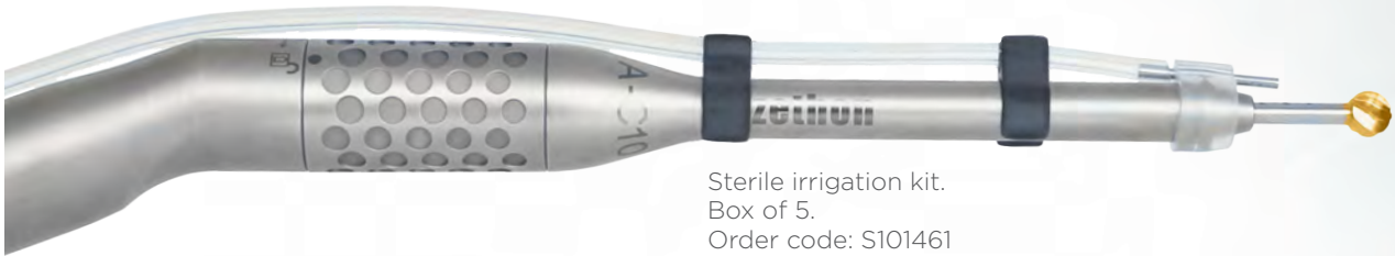
Sterile irrigation kit. Box of 5. Order code: S101461